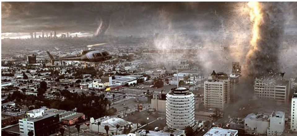
Destruction awaits the world in the Day of the Lord

[in the meantime, I await the rejuvenated Work of the Philadelphia Era]