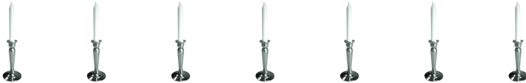
Seven individual candlesticks representing the Church – unlike the single candlestick representing Israel

Unfortunately, it is lamentable that those that reject the 'seven church eras' doctrine are missing out on some very important Biblical truths and principles. They also miss out on the wonderful truth that ancient Israel experience seven eras which parallel that of the New Testament spiritual Israel (see the paper The Seven Eras of Ancient Israel – Type of the Eras of the True Church? ).