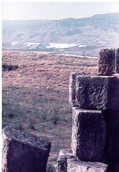
Little remains of Laodicea today

However, a casual reading of Matt 25 should tell us that it has prime reference to the sleepy, lack-lustre, lethargic and luke-warm end-time Church of God. From the context it is clear that half of the Laodicean Church will wake up to their shocking state, but only at the time of the Tribulation, while the other half will be shut out of the Kingdom. Why shut out? Could it be that fully half will descend into total apostasy and adopt Sunday observance etc?).