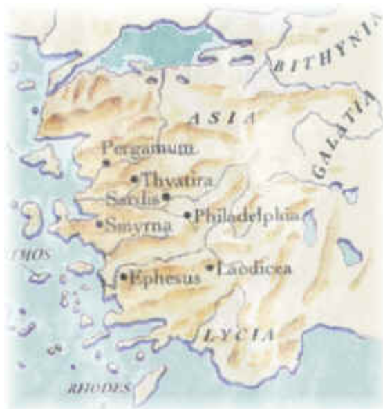
The Seven Churches of Rev. 2 & 3

More detailed information about these church eras will be supplied in a future article.