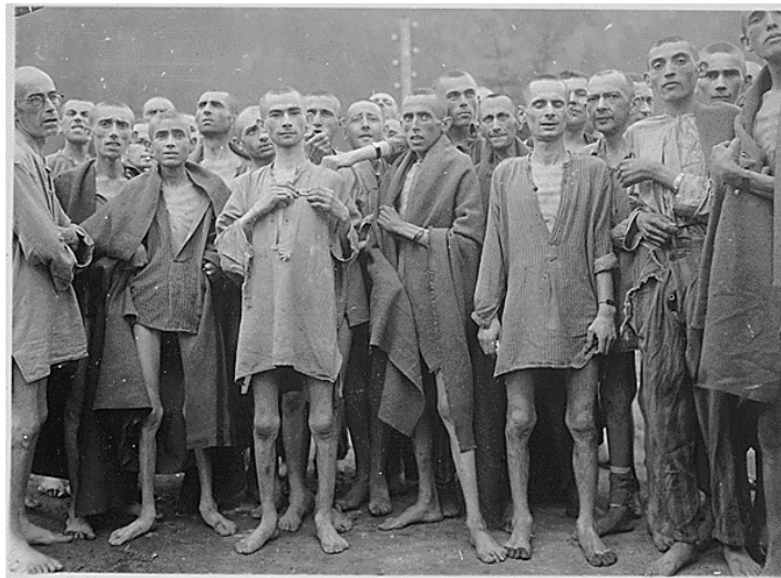
Concentration camp inmates – death camps are coming back!

Rev 7:9, 13-15; 11:1; 13:7, 10, 15; 16:6; 17:6; 18:24; Dan 12:7, 10; 11:35; 8:8-13, 17, 24; 7:21; 11:31; Is 1:5-9; 9:16; 3:12; 33:13-14; Jer 5:31; 9:7, 19; Is 4:3-4; Mal 3:2-3; Hos 4:6-12; Amos 8:3; 9:1; Ezek 5:3-4; 6:8-9; 7:16; 9:1-6; 11:16; 12:15-16; John 15:17-16:4.