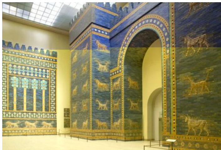
Above is the reconstruction of the Ishtar Gate and Processional Way at the Pergamon Museum, Berlin. It was reconstructed from material excavated by Robert Koldewey and completed in the 1930s

This occurred in 522-21BC when it revolted and was later captured for Darius by general Zopyrus (see Herodotus 3. 151-159). One of the walls was destroyed and its 100 gates dismantled during this siege that lasted around 2 years.