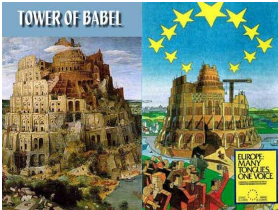
EU poster (left) compared to an artist's depiction of the tower of Babel (right)

(extracted from A Note on the Three Woes and Babylon/Tyre Parallels by C White)