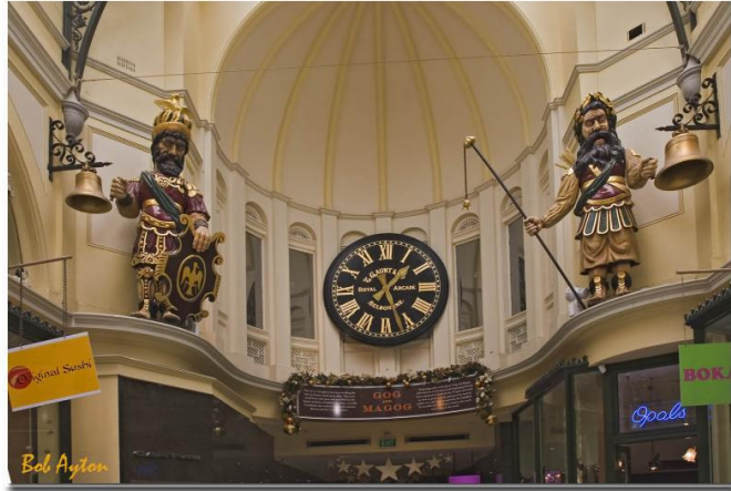
Gog & Magog, Royal Arcade, Melbourne

Treasures from all over the world will pour into the Holy Land swelling the wealth of Israel. Yet nations not reached by God through Israel will rise up in jealous indignation. It will do them no good as Ezekiel 38 and 39 demonstrate. The 'rest will be history' as they say.