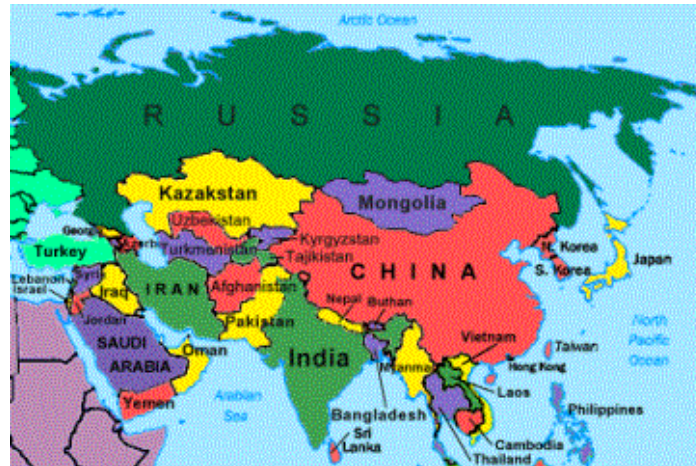
Locations of the descendants of Japheth today

Just as God gives us enough time to repent or show our true colours; just as He allowed Lucifer plenty of time to foment rebellion; so He will allow these forces to develop. The picture we get that these peoples are led by the forces that invaded the nations comprising the Beast power in Europe. As such, they comprise the remnants of the 200 million army pictured in Rev 9:16 (of which only 1/6 th of the Gog and Magog forces will be left after Christ deals with them).