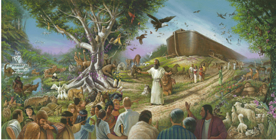
Noah and his ark