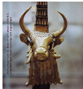
Bull in Ur