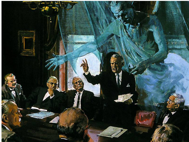
Satan's minions influence this world's governments and corporations

So here we clearly have a fallen host of heaven which has control over the non-Israelitish (gentile) nations of which there are 70. So there must be 70 Princes or bull demons (recall that a bull represents a prince or nation).