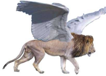
The first beast of Daniel 7

This presents us with a prophetic clue: the wings of a divinity symbolizes protection for the people that follow that particular god. This motif is found all over the Middle East. When the wings are found upon a human form it is the god Assur that is represented; without it is the sun god Shamash that is represented.