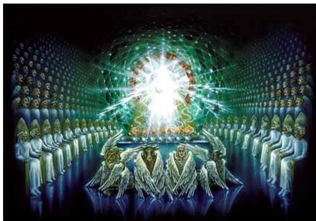
The Divine Throne Room with 24 Elders, Seraphim, Zoa and billions of other spirits

Here is reference to angelic beings spontaneously singing with absolute fascination for God's overwhelming power and energy that surged forth to create the earth. There is no mention or inference here of their involvement with the creation. 25