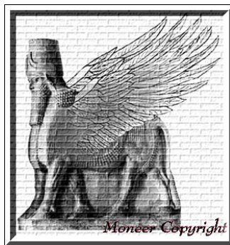
The Assyrian statue

It would appear that these were the princely demons operating behind the scenes, influencing the gentile leaders.