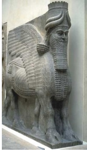
Winged bull figure with a human head from the Temple of Sargon II of Assyria (c. 700 BC)

One wonders if there is a very vague recollection of Lucifer's treachery toward God Almighty in this legend? No doubt Satan wish to take over the creative power of God Himself! "The wicked, in the pride of his countenance, saith , He will not require it . All his thoughts are, There is no God." (Ps 10:4)