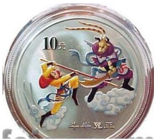
Bull demons in China

In Babylonia, figures of bull gods guarded the entrance into temples, houses and gardens (in contrast the lion of Judah was utilised extensively in the British Empire). During the Assyrian period a human face was added: at Khorsabad colossal human-headed winged bulls were found at the palace of Sargon II.