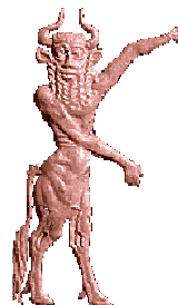
Bull man in Mesopotamia