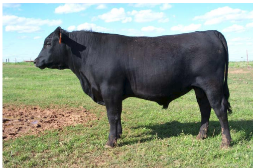
Bulls – symbols of strength and power

In Israel, the priests were the ruling class. In God’s sacrificial system, bullocks were offered to make atonement for them (Lev 4:3) while Israel as a nation were also to sacrifice a bullock for national sins (Lev 4:13-14). In contrast a leader was to sacrifice a male goat (Lev 4:22-23) while the common people sacrificed a female kid or female lamb (Lev 4: 27-28, 32). Therefore the Jewish interpretation of the 70 bulls seems appropriate as they relate to rulers, leaders and nations. In Genesis 10 where we find the Table of Nations, we find, beside the name of Noah, 70 other names, representing the 70 nations.