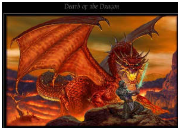
Christians are in a battle with Satan and the demons. Therefore wear God's armour (Eph 6:11-14)

So Peter seems to be saying that the entire universe may be transformed into the very energies from which it was created – which infers a degeneration that was caused by fallen spirits.