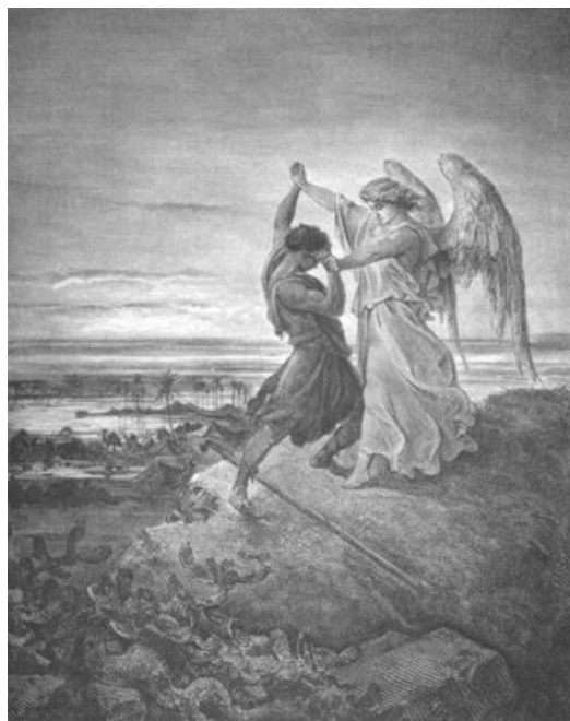
Jacob wrestling with an angel (Gen 32)

This study examines Paul's usage of the word in accordance the Biblical context, with the Greek, the historical context and understanding by early 'Christians'. From that we might deduce what he meant and gain appropriate Biblical insights.