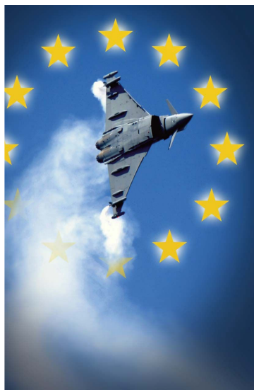
Europe is slowly, but surely, integrating its military

So there it is: Nimrod does not type the beast. Then what of Obama and those that claim he is the Beast?