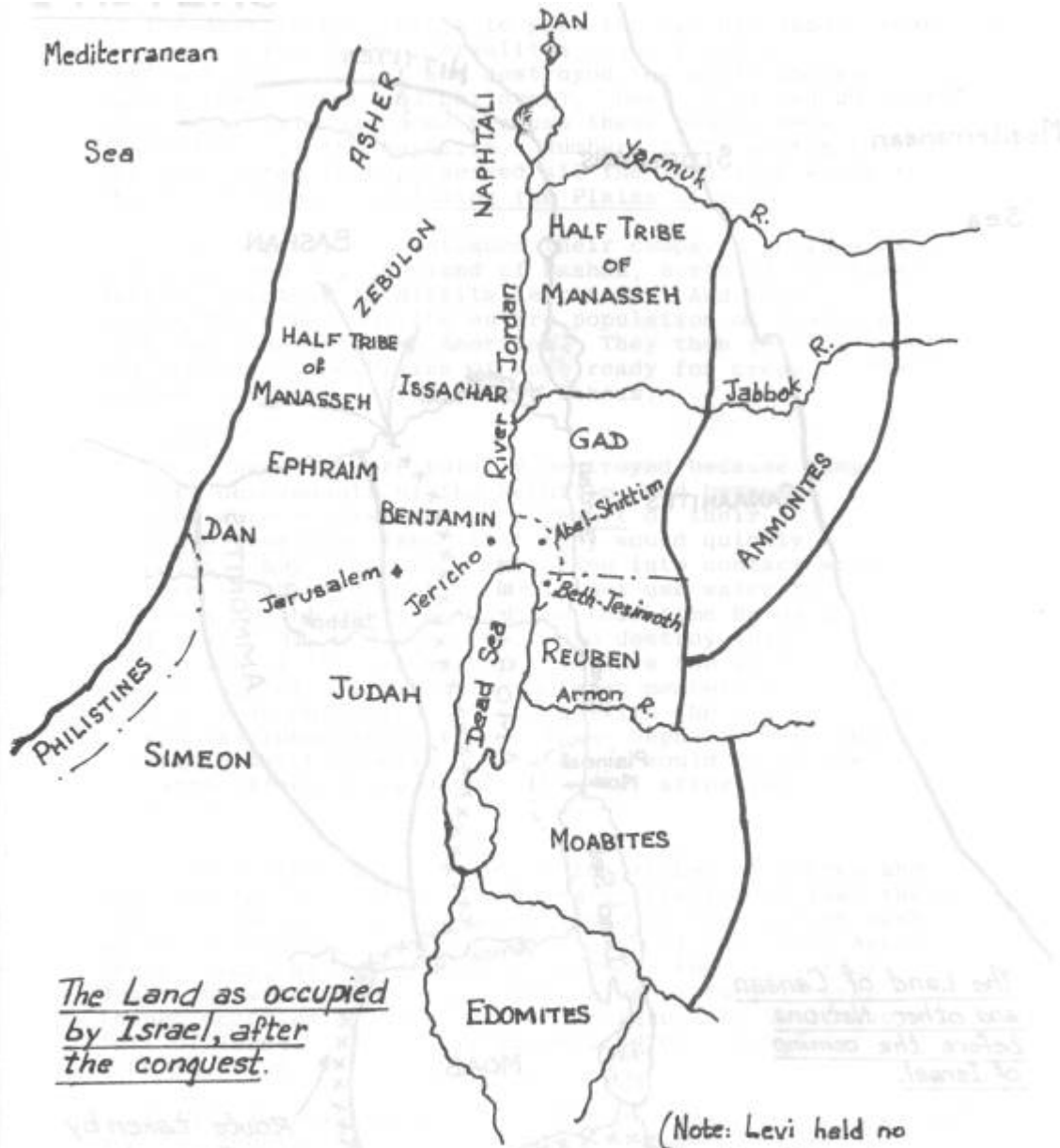
The Land as occupied by Israel, after the conquest.

(Note: Levi held no territory but had possession of 48 towns in the whole nation.)