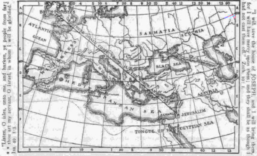
"Behold these (Israel in the isles) shall come from far, and lo, these from the north and from the west. The children which thou shalt have, after thou hast lost the other, shall say again in thine ears, The place is too strait (cramped) for me, give a place to me that I may dwell. Isa. 49: 12, 20. EPHRAIM—ISRAEL IN THE ISLES.

"I am a father to Israel, and EPHRAIM is my first-born. * * Declare it in the isles afar off, and say, He that scattered Israel will gather him, and keep him, as a shepherd doth his flock." Jer. 31: 9, 10.