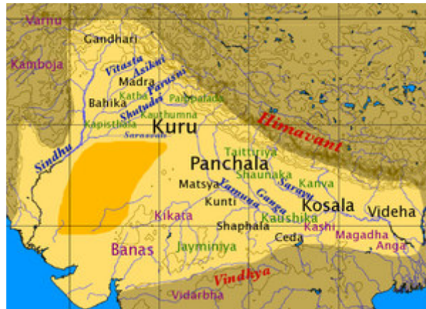
Ancient Gangetic India

Even if the Gangetic Indians knew little or nothing of India before 717, the distribution of ancient Gangetic tribes in India possesses some of the same symbolic value as the provinces of Ireland or the tribes of eastern Germany. The following map shows that the Upper Ganges was inhabited in ancient times by the Indian Panchala tribe. Waddell repeatedly states that Haryashwa was a member of the Panchala tribe, referring to this Indian version of Ur Nanshe as “Able Panch.” He connects this name with the historic label “Phoenicia” applied to the Syria-Phoenician region where the Indians settled in the First Kish period. In effect he labels Ur Nanshe’s aggressive regime at Lagash “Phoenician,” a label which harmonizes with our hypothesis that the Indian protoplast identified with Lagash (from Adab) after the Uruk-Aratta War: