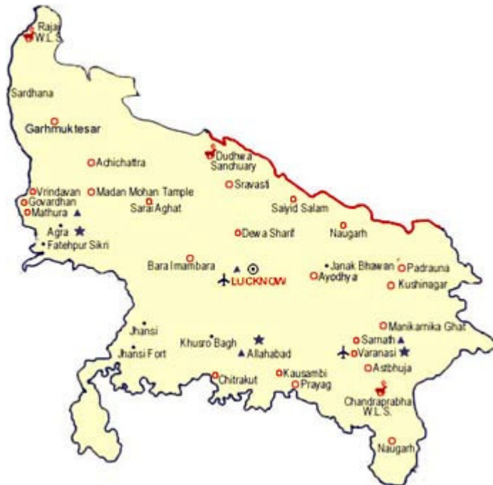
Map of North Central India www.sargamtravels.com copied May 16, 2008

Returning to the viewpoint of the Indians, we observe that the Indian lists are relegated to contrastive cults of sun and moon as though aware of the polarity of lunar Ur in the south and solar Sippar in the north. Waddell believes that the solar capital of Ayodhya in India is an anachronistic rendering of Sargon’s capital of Agade in Akkad somewhere in the region of Sippar. It is to the solar lines of Indian kings what Mathura is to the lunar lines. Mathura lies in the west of central India northwest of Agra as shown in the following map. Solar Ayodhya lies east of Lucknow, the airport site shown at the center of the map: