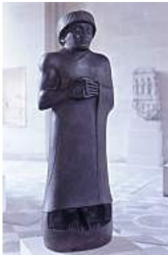
Standing Statuette of Gudea

contrary to linguistic fact, means nothing to me. The races of Noah's world were chiefly distinguished by the wives of the Ark—the Mahadevi tetrad. If my identification of Gudea as a latter-day version of Ur Nanshe-Heth's brother Sidon is true, this man was the offspring twice over of the white matriarch Uma, Ham's diluvian wife. Thus his race was three quarters Caucasoid and one quarter Ham's mixture of Noah's Asian character and Mahadevi's Amerindian or Aquiline character. If that is what Waddell means by "Aryans," so be it. All Indo-European speakers are Aryans in a linguistic sense. Afro-Americans are "Aryans" in that sense by speaking English. In a racial sense, the word "Aryan" as anything more than a synonym for "Caucasoid" is one of the stupidest idioms ever adopted. In plain English, Uma was a Cainite, a descendent of the first Caucasoid male Cain.