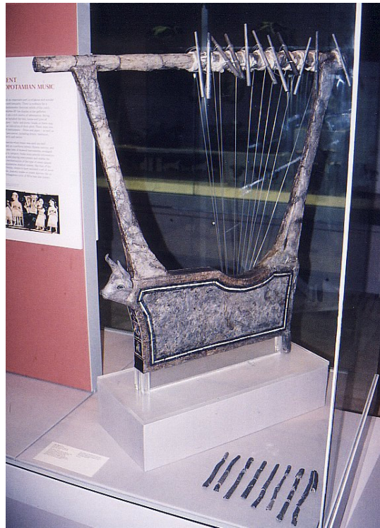
Harp Discovered at Ur (at the British Museum) www.greatcommision.com copied May 19, 2008

The harp found at Ur provides, not just a general observation on origins but in all likelihood, a revelation of the musical activities of Obal and Almodad at Ur and, as such, a concrete verification of a Hellenic myth as historical fact: